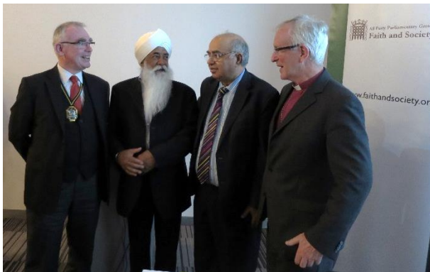
Birmingham City Council and faith group representatives, pictured with APPG Chair, the Rt Hon Stephen Timms MP, sign the Covenant